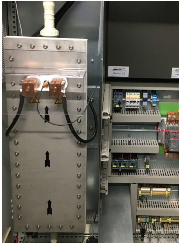
Module ClearFox ® DiOx 1.0