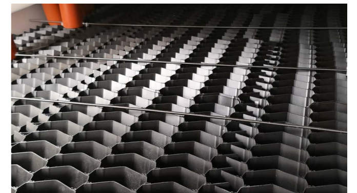
ClearFox® Lamella clarifier Physical separation of sludge and clear water