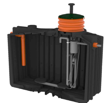
ClearFox® QuickOne+ Sewage treatment plant with proven SBR technology