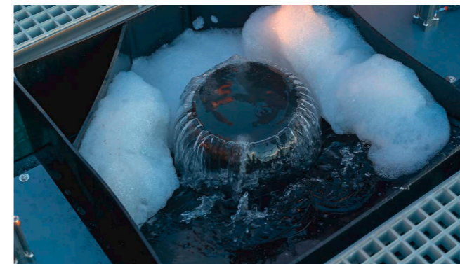
ClearFox® Dissolved air flotation Efficient separation of clear water and solids