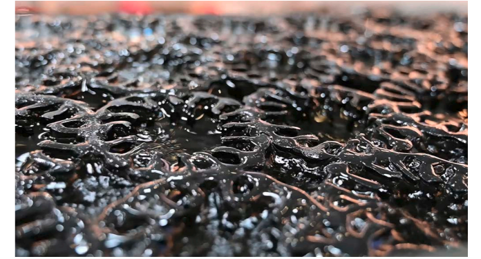
ClearFox® Fixed-bed biological reactor Biological wastewater treatment with a submerged fixed bed