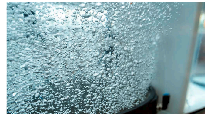
ClearFox® SBR Efficient solution for municipal and industrial wastewater