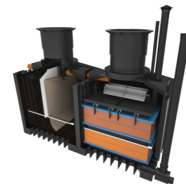
ClearFox® Nature Non electric sewage treatment plant for up to 50 PE