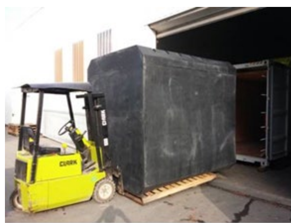
denitrification installation into a sea container