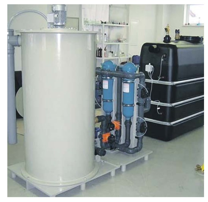
ClearFox® TBZ with reuse water tank up to 40m<sup>3</sup>/h

German Institute for Building Technology DIBT approval No. Z-83.3-28